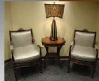
Luxurious Waiting Area