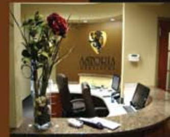
Front Desk with Friendly Staff