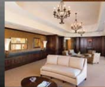
Client Lounge Area