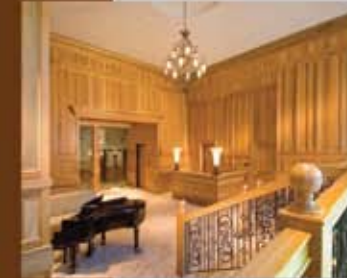
Welcome Desk in Astoria Building Lobby